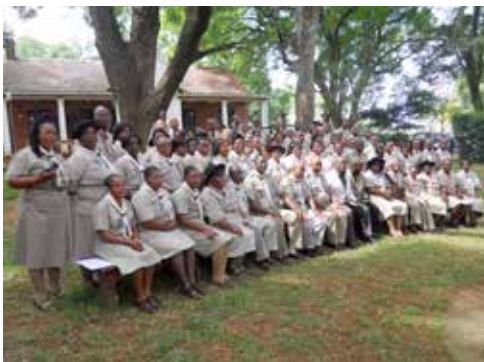
Proud new wood badge holders pose for a group photograph.